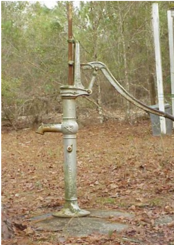
Hand pump wells in old cemeteries are a good source of shallow ground-water samples for arsenic and other metals analysis.

What significance does the presence of arsenic have for archeologists? Cemetery workers and others that may come into contact with contaminated soil or human remains at old burial sites or cemeteries? Because the main routes of exposure are ingestion, inhalation and skin contact, there can be important health and safety implications for personnel working at sites where arsenic is present in sufficient concentrations.